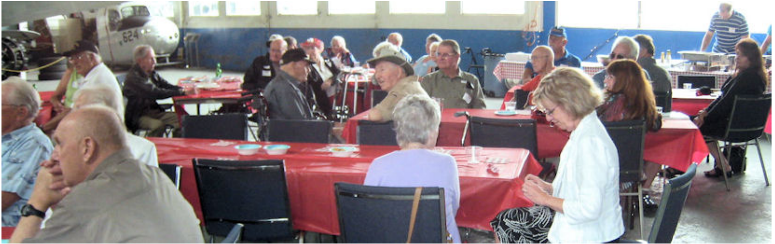
Above & below: Taloans & guests listen to a short welcoming address and then its on to lunch!