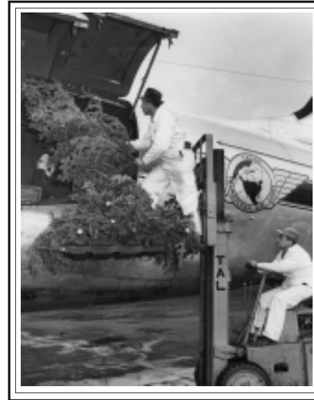
Christmas Trees from Seattle to Fairbanks, Alaska

Get your wedding dress, marriage license, and airplane tickets for your honeymoon all in one building!