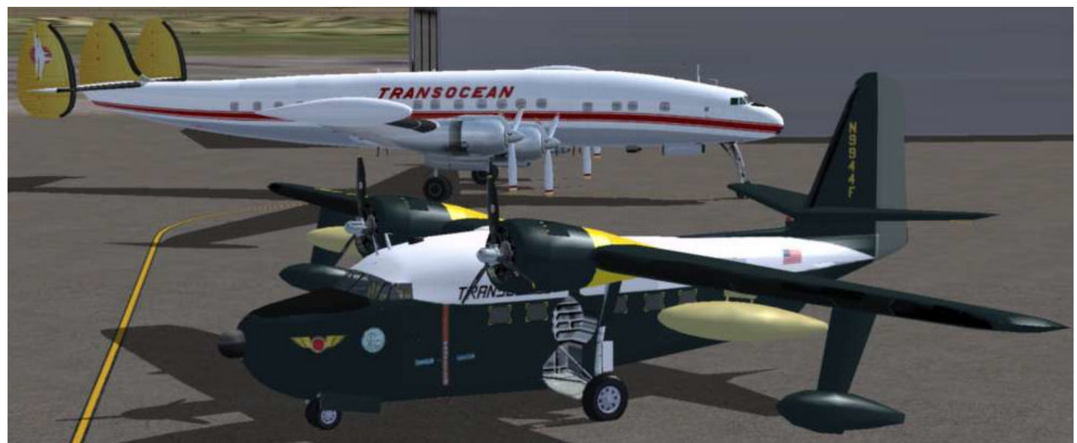
Painted SA-16 simulation for Microsoft Flight Simulator by Dave McQueen